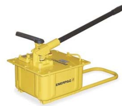
Large Capacity Pump