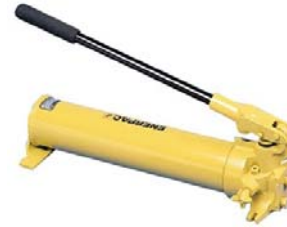
Small Capacity Pump