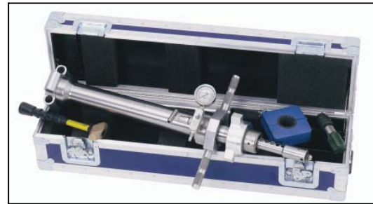
RBS Retriever KIT shown with RBS Retriever, Wood Clamp, Brass Hammer, Thread Tap, and Field Service box.