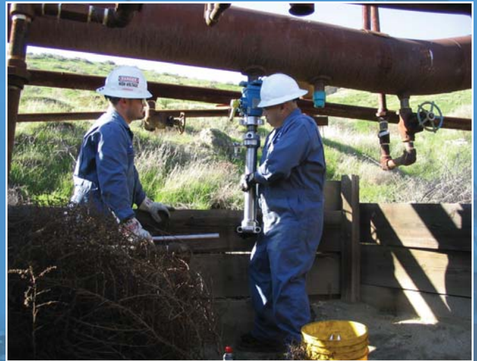
Retrieval of COSASCO® Coupons Under Pressure

Rohrback Cosasco Systems skilled field technicians are trained and certified to only the highest standards to provide an unsurpassed quality of service. We offer a complete range of services from retrieval of corrosion monitoring and chemical injection devices to project engineering and design of custom online corrosion monitoring systems. RCS will make every effort to provide you with the most efficient and affordable products and services with safety and quality as a number one priority.