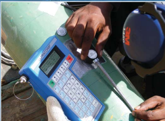
Installation of Ultracorr® Sensors and Instrumentation