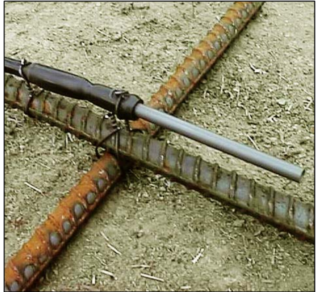
Probe mounted just above Rebar

To prevent deterioration of the reinforced concrete infrastructure, many new structures are installed with Cathodic Protection. CORROSOMETER® probes evaluate the effectiveness of the Cathodic Protection system, as well as provide a test piece that can be electrically isolated to facilitate Cathodic Protection measurements such as de-polarization rates.