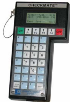
Checkmate Portable Instrument

To monitor these concrete probes, the simplest method is to use a portable CORROSOMETER® instrument such as the Checkmate.