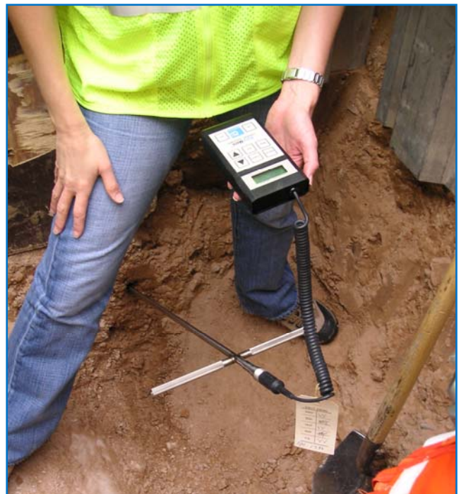
Direct Corrosion Rate Measurement using the Aquamate™ and Soil Rate Corrosion Probe

The new Corrater ® Soil Corrosion Rate Monitor changes all of that, and allows a quantitative measurement to be made quickly and easily at the time of the pipe excavation and inspection. Multiple readings can be taken, at different locations around the pipe to check on the consistency of the soil corrosivity.