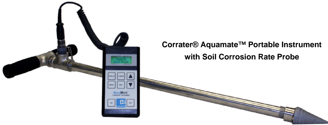
Corrater® Aquamate™ Portable Instrument with Soil Corrosion Rate Probe