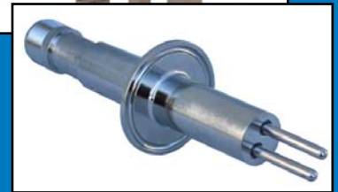
Rouge Monitor with Stainless Steel Probe