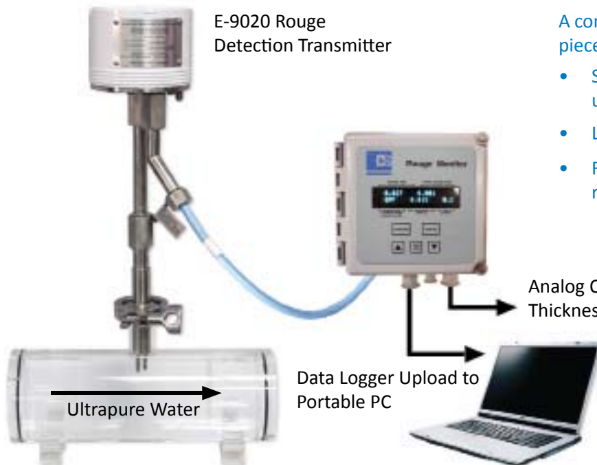
E-9020 Rouge Detection Transmitter

A complete Rouge Monitoring System consists of three pieces: