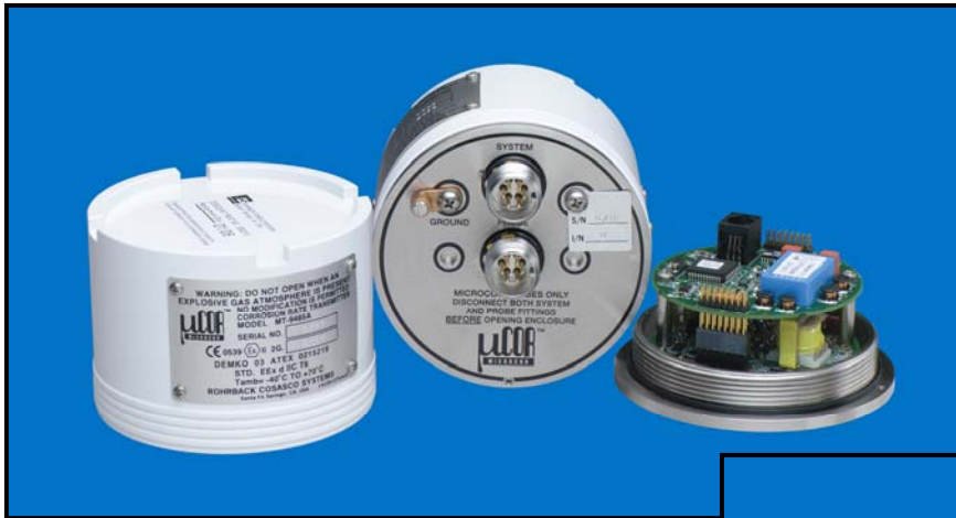
Model MT-9485A Transmitter