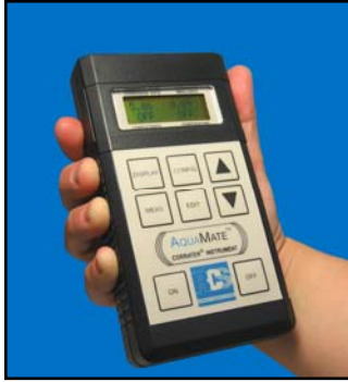
Portable Corratr Test Instrument (fits easily into a pocket shirt)