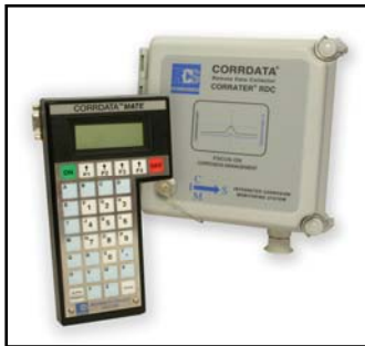
CorrdData Remote Data Collection System (multiple power and communication options)

Readings are taken at intervals and the corrosion rate is recorded. This same unit may be used to record concrete resistivity using stainless steel electrodes, and temperature. For more automated systems the CORRDATA range of datalogging instruments is available. These instruments enable data to be collected on a frequent and regular basis for subsequent collection and downloading to CORRDATA Plus software. This ensures continuous monitoring of corrosion rate.