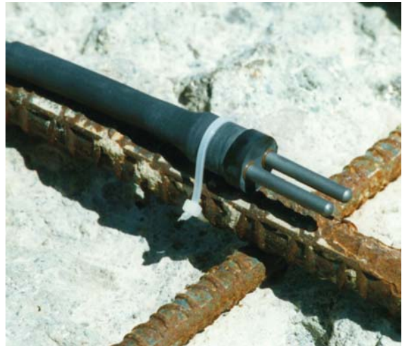
Probe mounted above the rebar Electrode length 1.25" (32mm)

The steel reinforcement in concrete structures is susceptible to corrosion when chloride ions enter into the concrete from de-icing salts applied to the concrete surface, or from seawater in marine environments. If chlorides are present in sufficient quantity, they disrupt the passive film on the reinforcing steel, resulting in corrosion. Oxygen content, moisture availability and temperature also affect this corrosion rate. Corrosion of the reinforcing steel can weaken the structural strength; create cracking, delaminating and spalling of the concrete. In these systems CORRATER probes may be used to assess the instantaneous corrosion rate of steel in concrete, the concrete resistivity, and optionally the temperature.